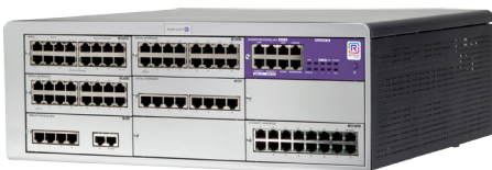
OXO Connect Large

Alcatel-Lucent OpenTouch Suite for SMB offering is based on the new generation of communication server called OXO Connect. This robust communication server for small and medium companies is ready to connect and deliver cloud services with an extended capacity of up to 300. OXO Connect is the new generation of OmniPCX® Office RCE with a clear, future-proof direction for connecting to cloud services and delivering advanced services to SMBs. Moreover, OXO Connect has a simplified licensing built on a single Universal Telephony License and a new service offer that guarantees three years of free software upgrades. With this new offer, Alcatel-Lucent Enterprise starts a new era for SMB and confirms its leading position in this market.