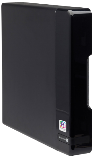
OXO Connect Compact

To compete and succeed in today's marketplace, small- and medium-sized businesses (SMBs) need enterprise-class products. With increased simplicity, confirmed robustness and being connected, – all at a lower cost – the Alcatel-Lucent OpenTouch® Suite for SMB helps businesses grow.